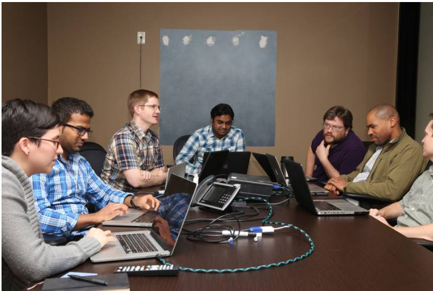
A meeting at Digital Reasoning offices last month.

Reasoning raised $24 million from a group of banks led by Goldman Sachs Group Inc. and Credit Suisse. So far, it has publicized contracts to assist the compliance teams of UBS and Point72, the $11 billion firm run by Steven A. Cohen that was formerly known as SAC Capital.